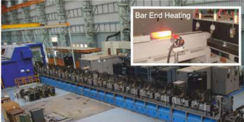
Bar End Heating

World's No.1 Solution Provider For Induction Forge Heating & Heat Treatment