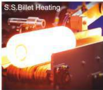
S.S. Billet Heating