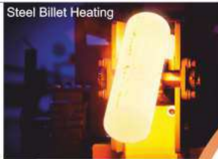
Steel Billet Heating